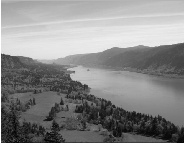
Columbia River Gorge

In addition to the ongoing efforts of the USRT, its member Tribes, and federal/state agencies/entities, the licensing process, as well as recently initiated recovery efforts in the Basins, provides a firm basis to meet Tribal needs regarding resource conservation, protection, and enhancement. This policy will provide direction to USRT and Tribal staff for participating in regional processes as well as for the future development of resource- and process-specific USRT plans and guidelines.